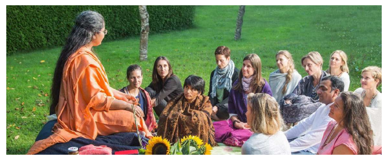
The Individual Deities