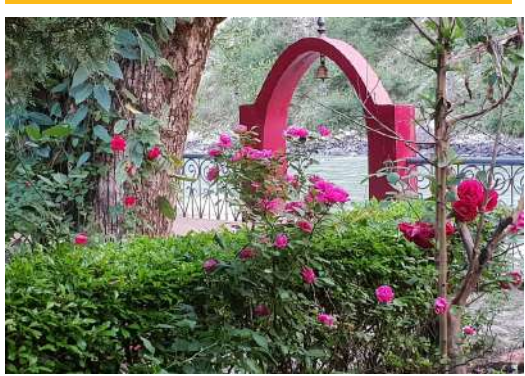
Tapasyalayam Apr, 2019

Spring has arrived. It is a bliss to dwell in the laps of Gangama along with Ammaji teachings. Sharing a glimpse of Tapasyalayam thats filled with wonderful fragrances of roses, jasmine, night queen flowers everywhere!