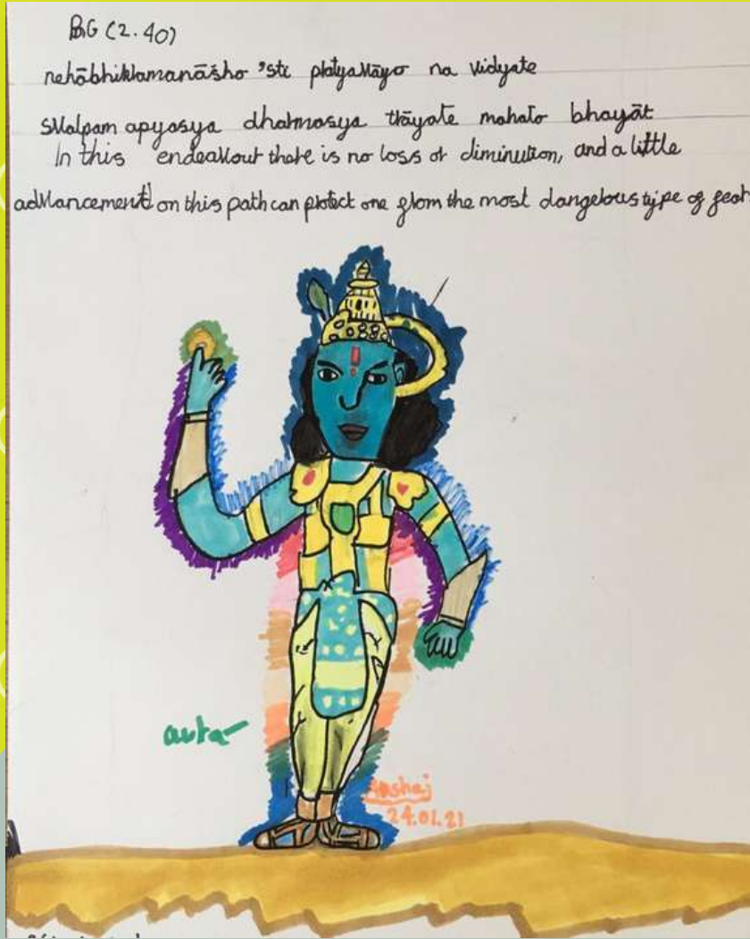
Artwork(bhagavad Gita Verse 2.40)Illustration>>>by Akshaj Pokkula