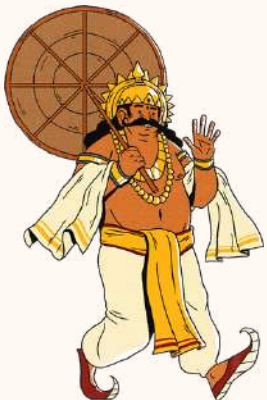
Onam was celebrated on 29 August with flower decoration by the Staff.